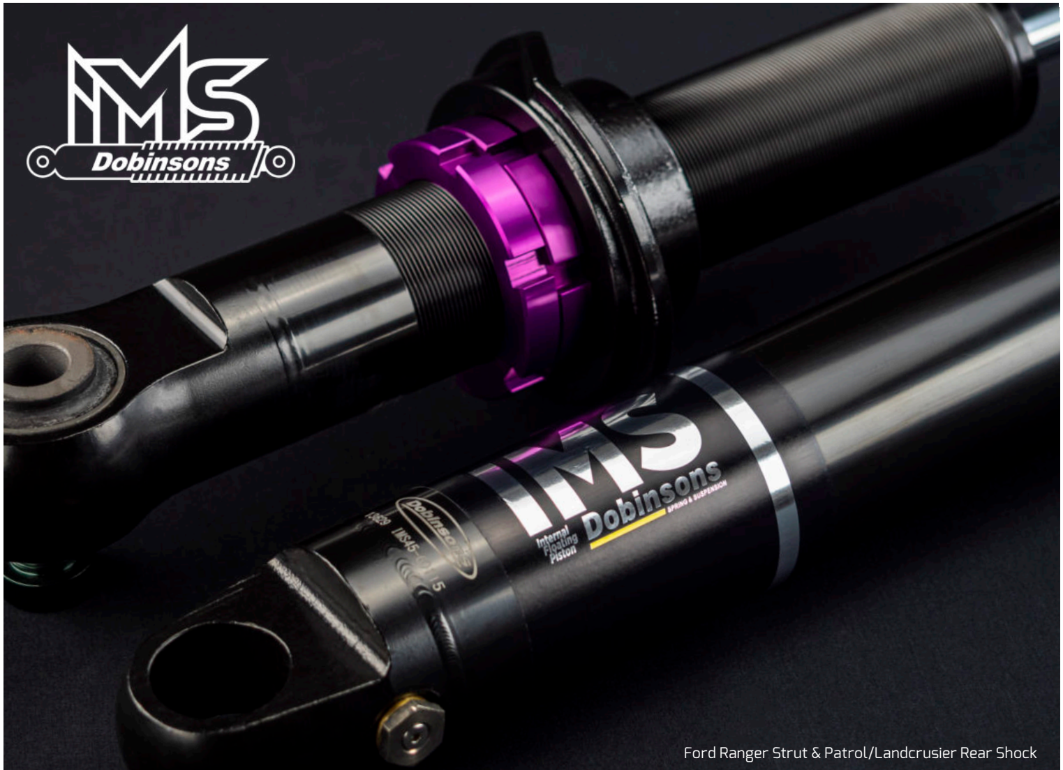
Ford Ranger Strut & Patrol/Landcruiser Rear Shock

Dobinsons IMS monotube shock absorbers are designed for next level performance over twin tube shocks in those hot, harsh, demanding conditions. By utilising the monotube design, Dobinsons IMS shock absorbers are able to resist fade far longer on corrugated roads, long or hard working 4WD trips, towing or racing conditions.